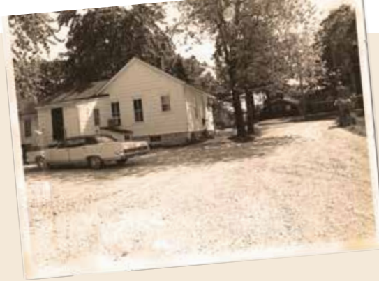
The original restaurant in Glenwood circa 1970